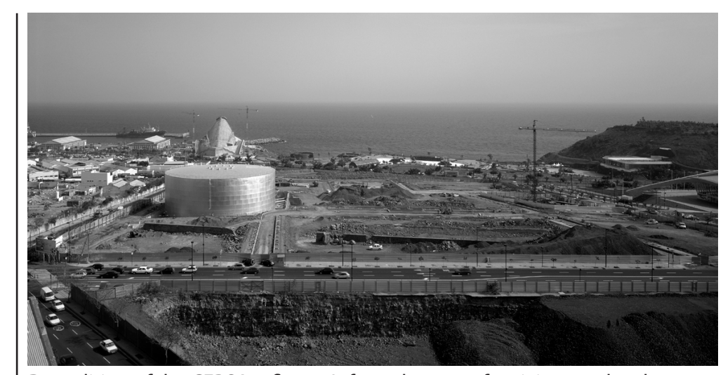
Demolition of the CEPSA refinery. Informal group of activists - today the non profit Amigos del Tanque - opposes the demolition of Tank 69 and begins a fight to have it listed as industrial heritage and repurposed as a cultural space