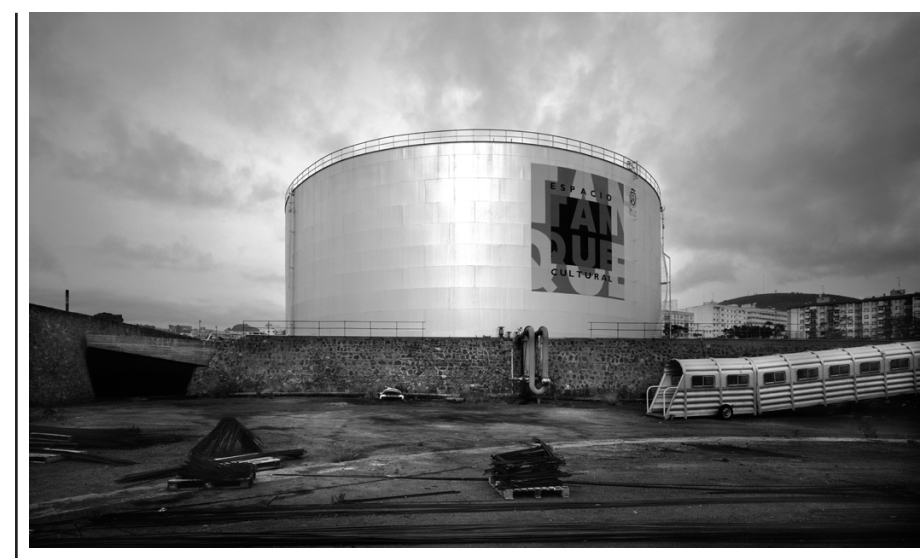
El Tanque and its site are declared a BIC (protected industrial heritage), the first in the Canary Islands